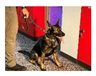
"Camper," Carson's gun-sniffing dog